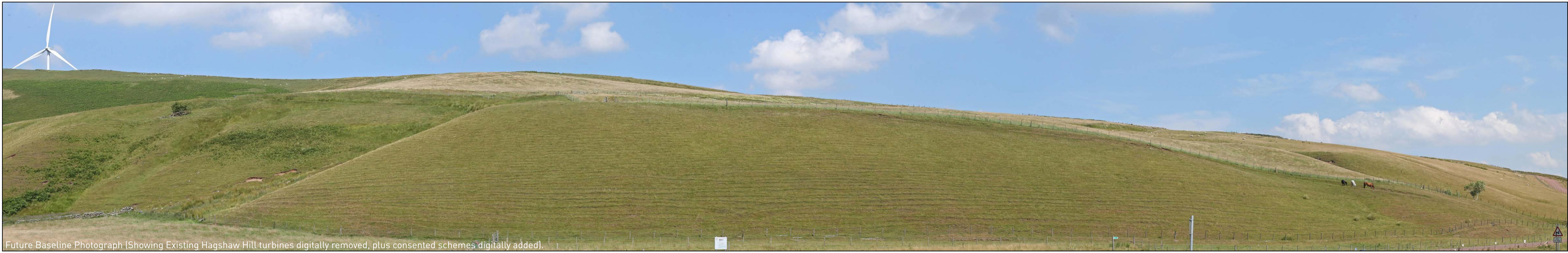
Future Baseline Photograph (Showing Existing Hagshaw Hill turbines digitally removed, plus consented schemes digitally added).