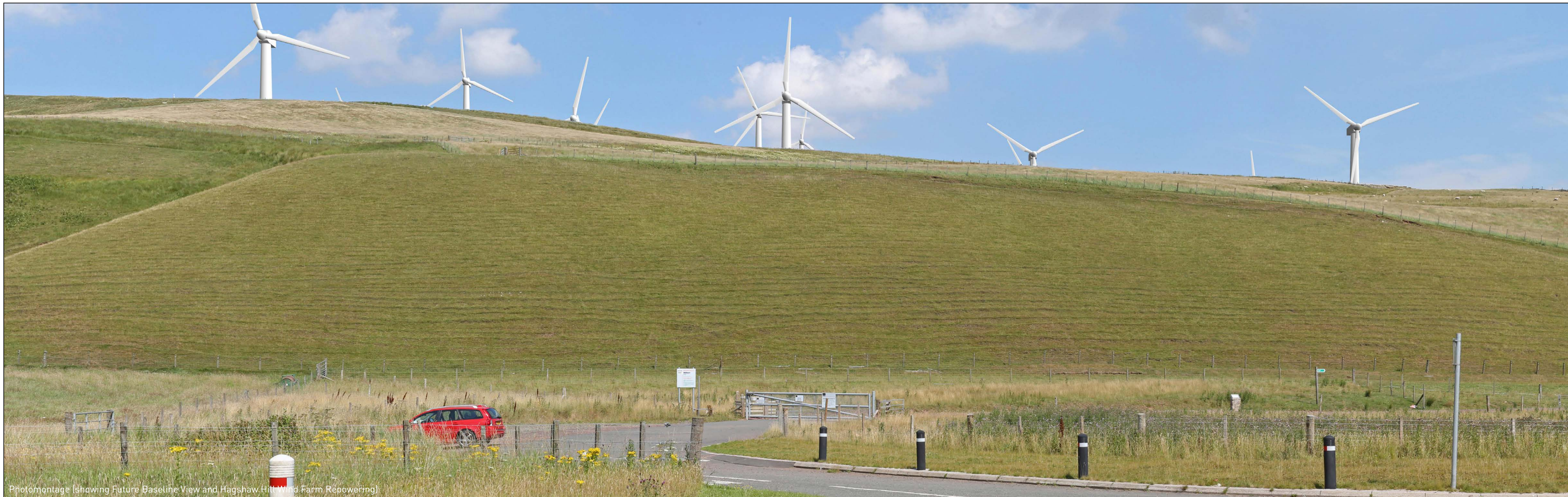
Photomontage (showing Future Baseline View and Hagshaw Hitt Wind Farm Repowering)