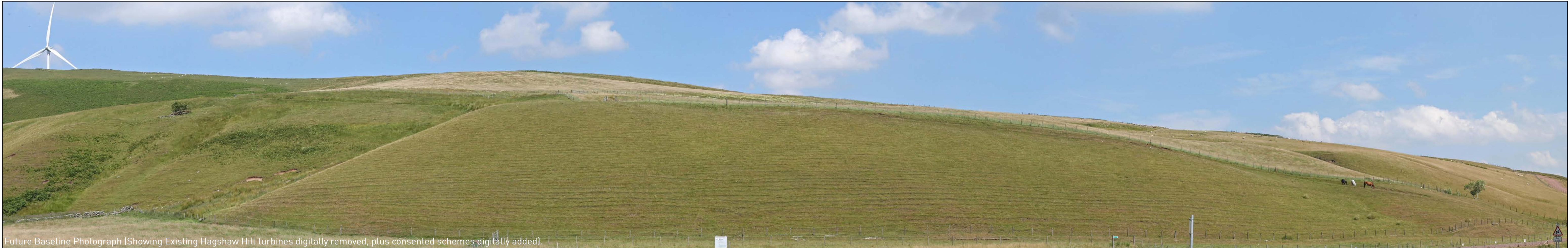
Future Baseline Photograph (Showing Existing Hagshaw Hill turbines digitally removed, plus consented schemes digitally added).

Figure 6.40 (sheet A) Viewpoint 9: A70 east of Monksfoot Bridge HAGSHAW HILL WIND FARM REPOWERING